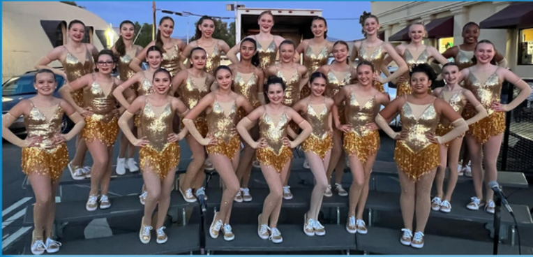
Spirit of Christmas