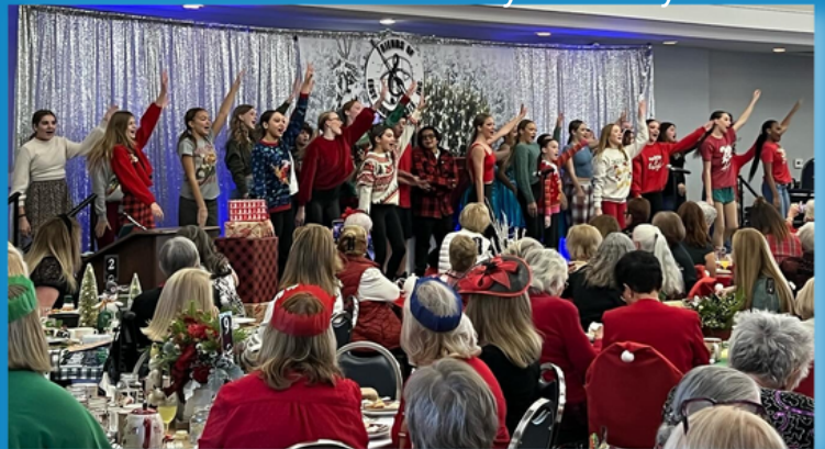
Friends of East County Holiday Tea